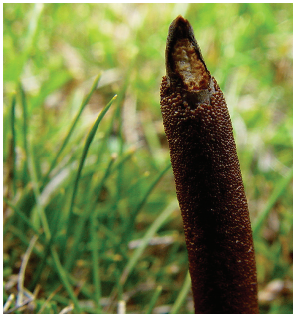
FIGURE 2. Close up of wild Cordyceps showing spore-bearing surface and slight insect-feeding damage at the tip.

In historical and general usage, the term “ Cordyceps ” normally specifically refers to the species C. sinensis . However, the name “ Cordyceps ” has come to be used for a number of closely related species over the last few years, which have been