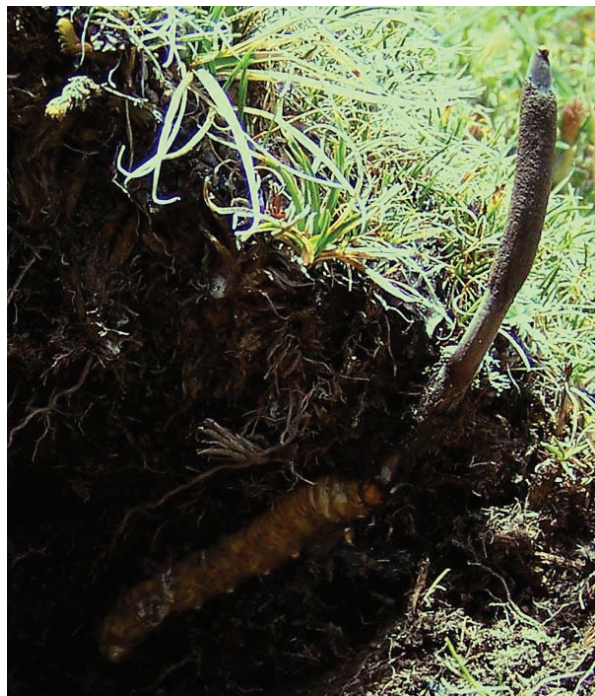
FIGURE 1. Cordyceps sinensis in its natural habitat (4550 meters in Tibet, China).

Most people in the West have only come to know about Cordyceps within the last 20 years, during which time, modern scientific methods have been increasingly applied to the investigation of its seemingly copious range of medicinal applications in an attempt to validate what Chinese practitioners have noted for centuries. 3