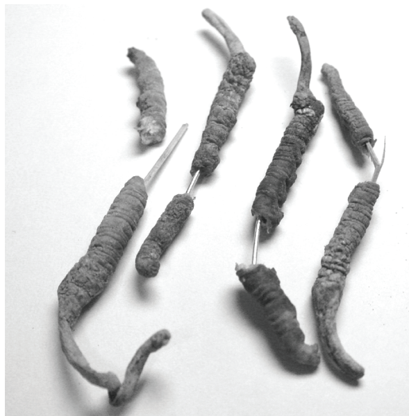
FIGURE 4. Wire and twigs inserted into Cordyceps to increase weight.

Although the presence of lead or other substances in the growth medium certainly could be absorbed by any growing organism, these authors have conducted chemical analyses on many thousands of Cordyceps samples over the years, and it has been our observation that Cordyceps does not have any more of a tendency to accumulate lead or other heavy metals than any other fungi. Cordyceps cultivated by any of the usual modern practices is very safe from any heavy metal contamination.