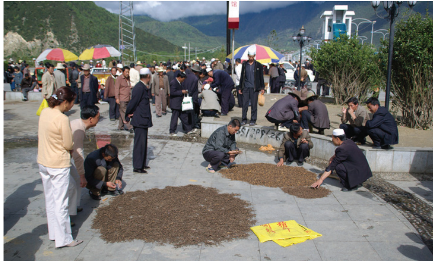
FIGURE 3. Cordyceps market in Ningchi (aka Bayi), Tibet. Cordyceps spread out on the road for buyers to view.

found to be much easier to cultivate. Although C. sinensis may be the most well-known species, there are many other species in the genus Cordyceps in which modern science may have uncovered potentially valuable medicinal properties.